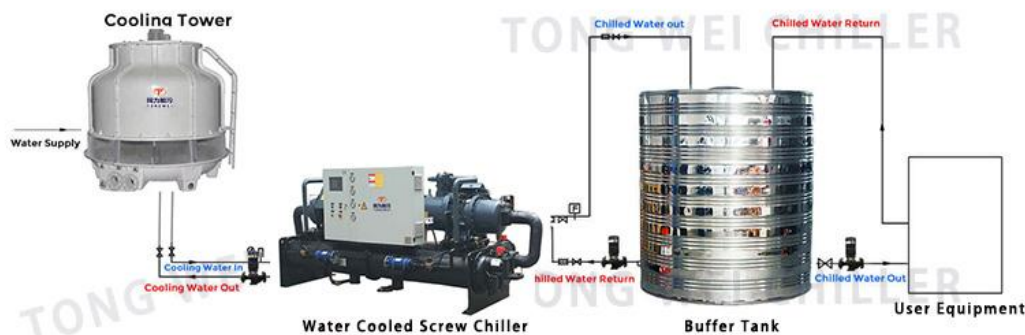
Water-cooled Chemical Chiller Installation Drawing

Should you choose an air-cooled or water-cooled chemical chiller? Contact Us for help determining the best solution for you.