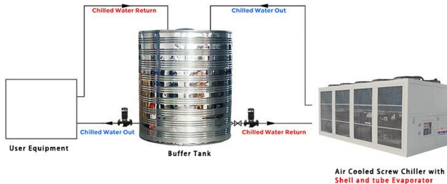
Air-cooled Chemical Chiller Installation Drawing

Water-cooled chemical chillers use water from an external water cooling tower to dissipate heat from the brewing processes. These systems are longer lifespan, Relatively quiet, and more consistent cooling performance than the air-cooled chemical chiller.