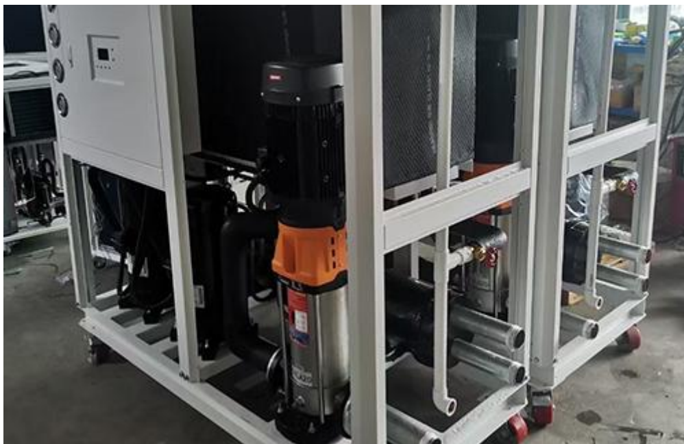
High Pressure Water Pump