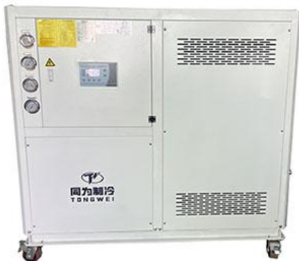
Water-cooled Chemical Scroll Chiller