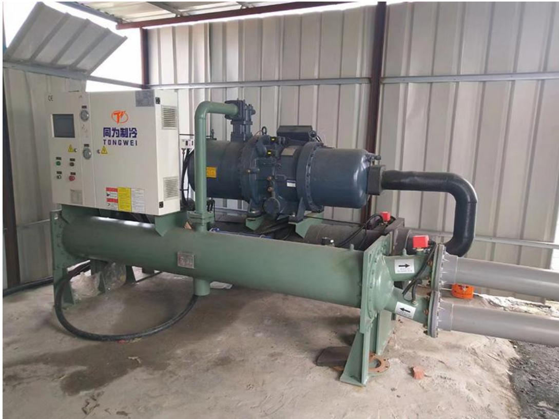
60 Ton Water Cooled Screw Medical Chiller

The pharmaceutical industry prepares medicines by processing through different heating and cooling parameters as blending, extrusion, mixing firmly adjusted by the unique efficient working of Pharmaceutical & Chemical Chiller.