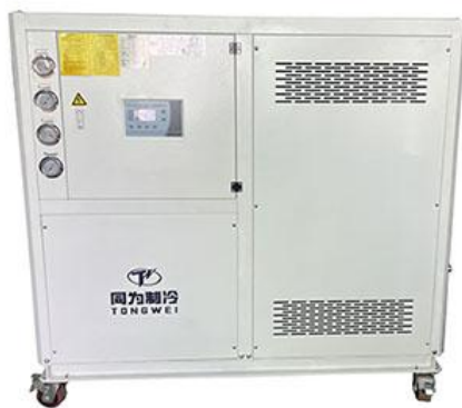
Water-cooled Food Processing Scroll Chiller