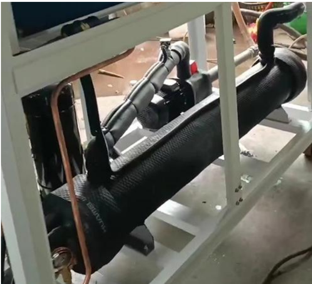
Shell and Tube Evaporator