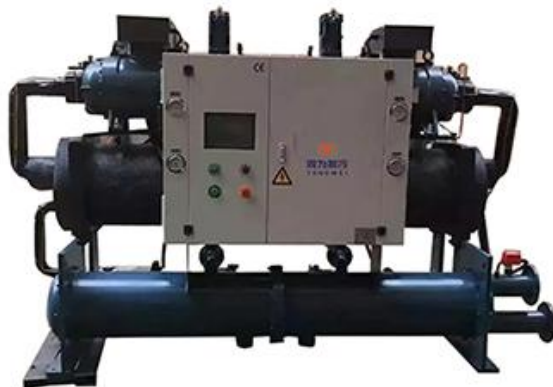
Water-cooled Food Processing Screw Chiller