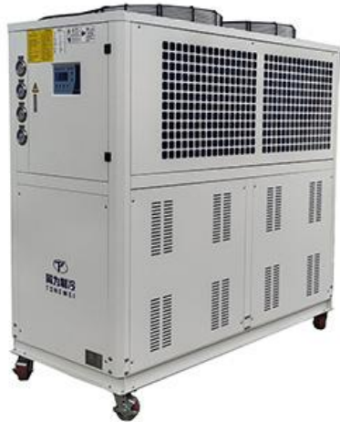
Air-cooled Food Processing Scroll Chiller