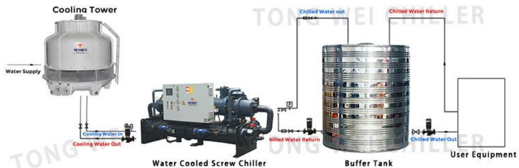
Water-cooled Food Processing Chiller Installation Drawing

Should you choose an air-cooled or water-cooled Food Processing chiller? Contact Us for help determining the best solution for you.