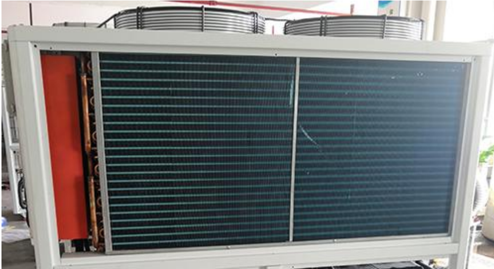
Aluminum fin+fan Condenser for air-cooled brewery chiller

The condenser for air-cooled Food Processing chiller is equipped with efficient cross-seam fins and female threaded copper tubes for high heat exchange efficiency and good stability. Its function is to cool down the refrigerant steam released from the compressor into a liquid or gas-liquid mixture.