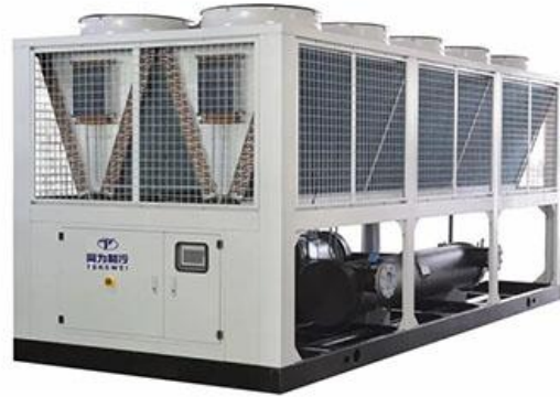
Air-cooled Food Processing ScrewChiller