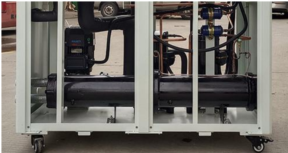
Shell and tube Condenser for water-cooled brewery chiller

The condenser for water-cooled Food Processing chiller is shell and tube, with the internal copper tubes employing an outer thread embossing process. This design effectively enhances the heat exchange efficiency between the refrigerant and water during the process. Compared to traditional smooth copper tubes, the outer thread embossing process increases the surface area of the copper tubes, thereby expanding the contact area for heat exchange and improving the thermal conductivity of the condenser. This optimization design allows the condenser of the water-cooled chiller to transfer heat from the refrigerant to the water more rapidly and consistently, enabling the water to carry away the heat.