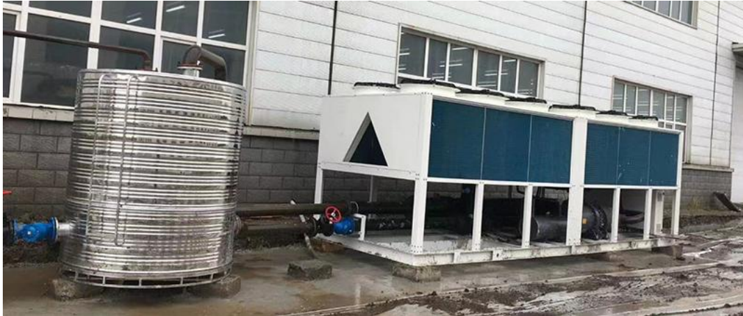
80 Ton AirCooled Screw Food Process Chiller

A food processing chiller is a specialized chiller machine designed for use in the food industry. It's employed to cool, freeze, or maintain specific temperatures in various stages of food production and processing. Food processing chillers play a critical role in ensuring food safety, quality, and compliance with regulatory standards.